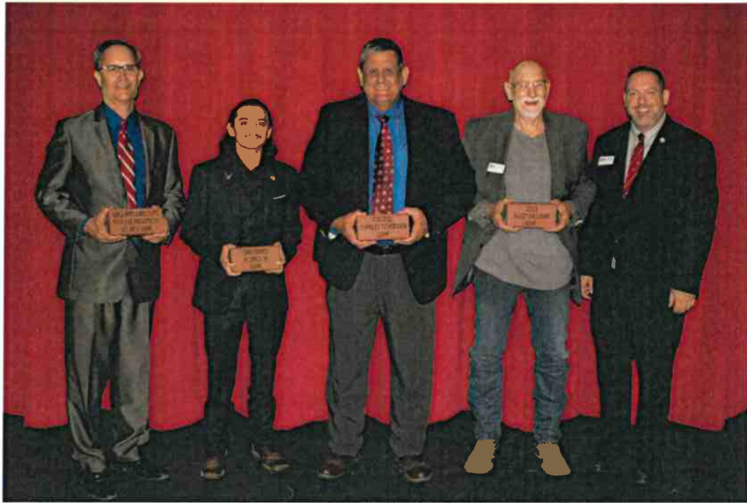
Hill College honors veterans with an evening of gratitude