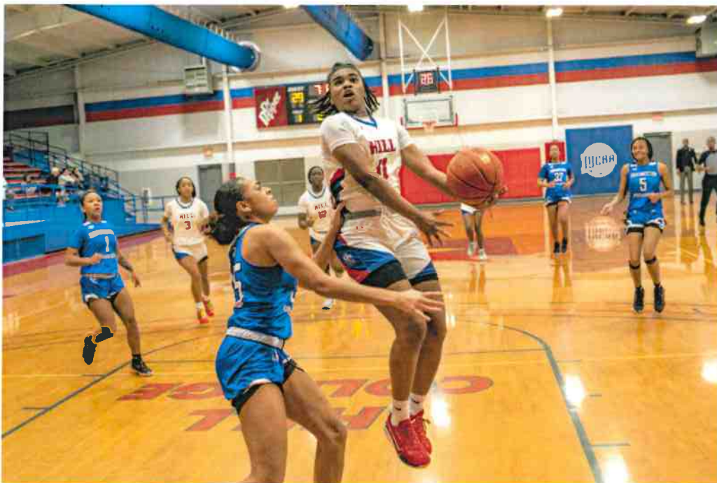
Hill College women's basketball team 'loaded' with freshmen talent