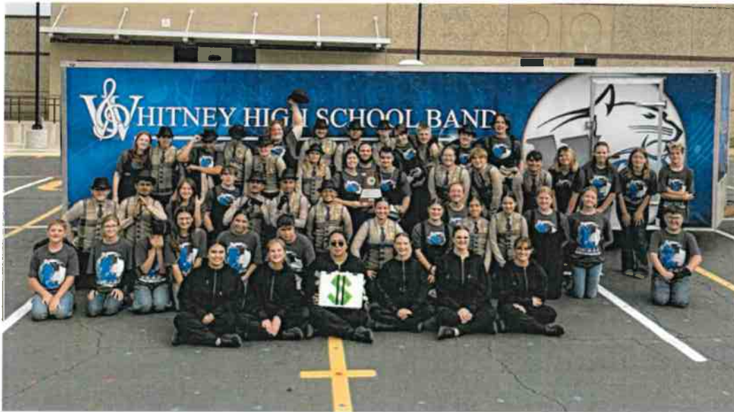
The Pride of Whitney Band earns straight 1's at region UIL contest! We advance to area contest on Oct. 26 in Robinson.