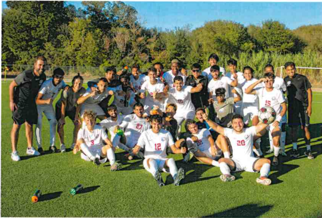
Hill College Men & Women Soccer